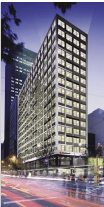
The Melbourne Centre for Financial Studies Level 10, 330 Collins Street, Melbourne, in the heart of the Melbourne CBD.

The Melbourne Centre for Financial Studies will achieve its goals in a number of ways. First, it will facilitate linkages between "town and gown", assisting each to better identify the opportunities for mutually beneficial collaboration. Second, it will identify and undertake both pure and applied finance research of particular interest to the Melbourne financial and business sectors. Third, it will facilitate the transmission of developments in finance knowledge between practitioners and academe. Fourth, through its publications, conferences and workshops, and development of international linkages with key institutions and individuals, it will promote Melbourne as an international centre for finance practice, research and education.