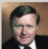
The Minister for Financial Services, André Haermeyer MP